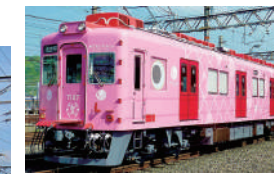
Medetai (happy) Train