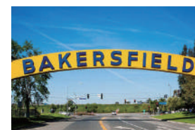
Bakersfield City (USA)