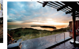
Outdoor hot spring