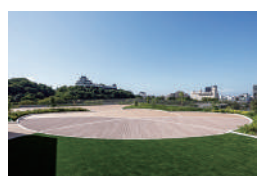
Wakayama-Jo Hall's roof is the perfect photo spot for Wakayama Castle!