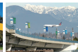
Richmond City (Canada)