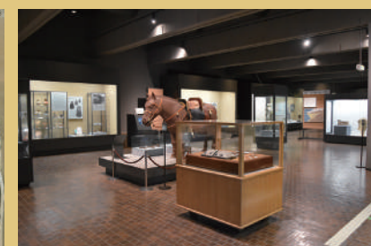
Permanent Exhibition Hall