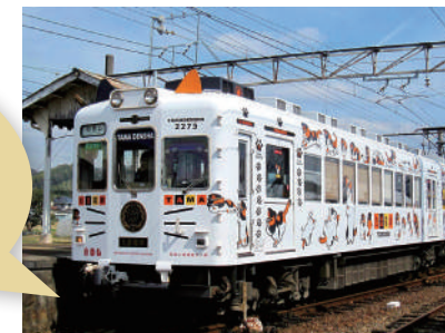
Stationmaster Tama's Train Designed by Eiji Mitooka+Don Design Associates

From themed trains to hot springs, Wakayama City is filled with fun, cute, and pleasant adventures.