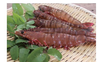
Agriculture and Fishing Industry