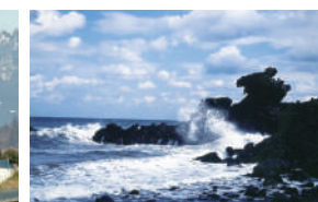
Jeju City (South Korea)