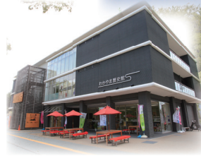
Wakayama Historical Museum